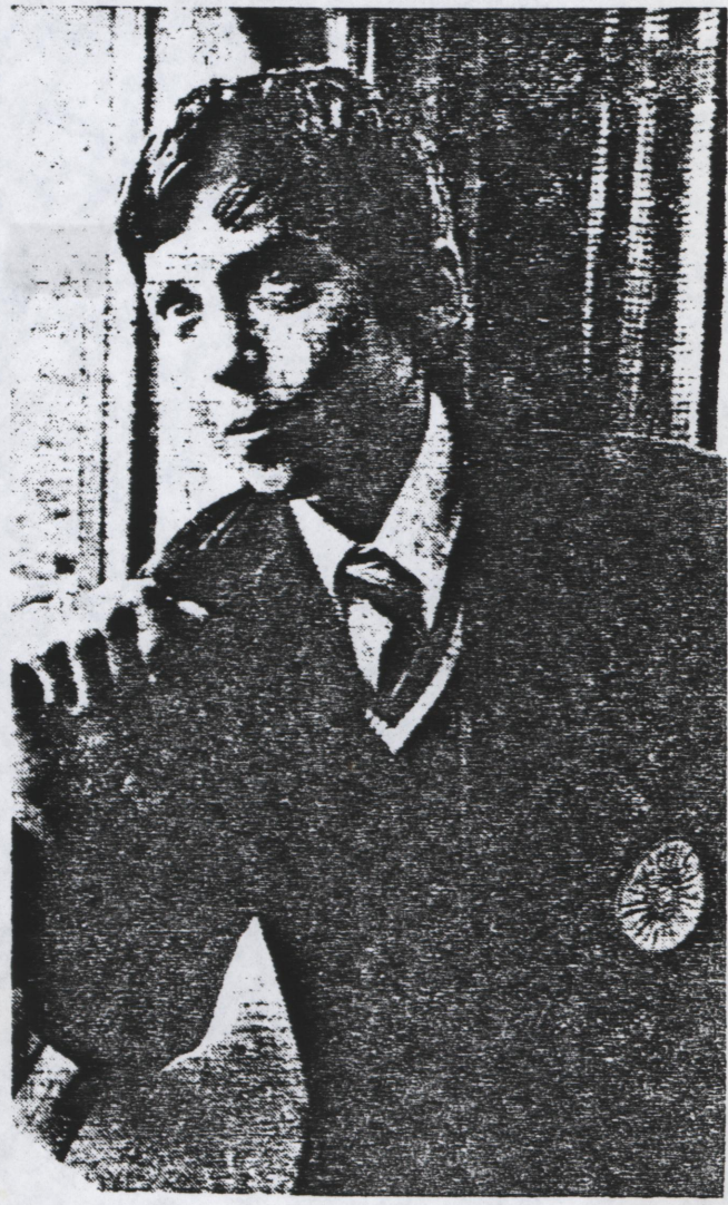
DONCASTER EVENING POST 18 FEB 81.

But the picture (seen here), taken by a 14-year-old boy, is enough to make any one wonder if we are being watched after all.